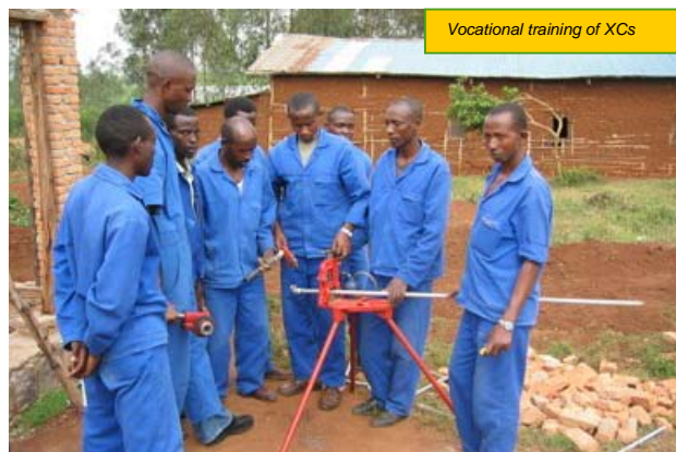
Vocational training of XCs

complement to these opportunities, economic skills and entrepreneurship courses are also offered.