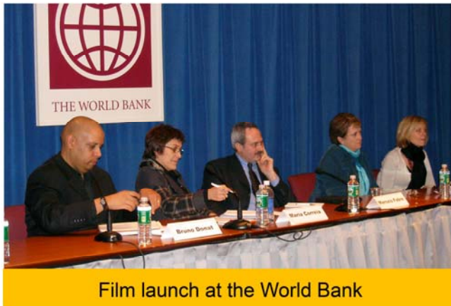
Film launch at the World Bank

discussions at the Overseas Development Institute (ODI) and the Department for International Development (DFID) in the United Kingdom, the European Network for Central Africa (EURAC) in Belgium as well as several events in France.